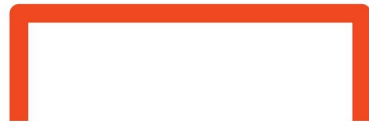
Indoor Networking Rack 4U-15U